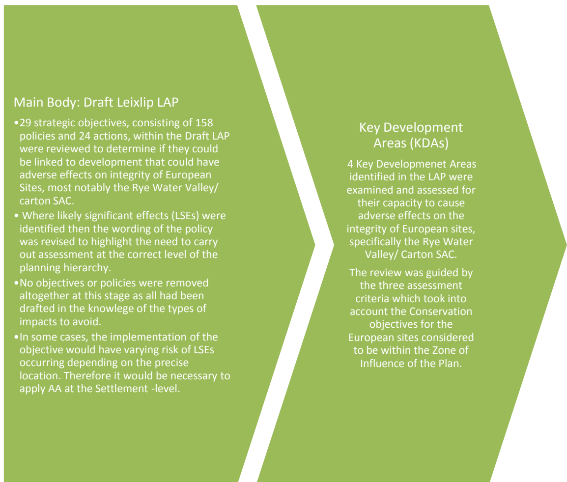
Figure 2: Sequence of Analyses of the Draft LAP.

Each KDA was assessed to determine if it would pose an adverse effect on site integrity in terms of the site's Conservation Objectives. The three assessment criteria listed in Section 3.7 above were applied to the KDAs. The adverse effects of implementing the proposed developments on the criteria (and hence on the Conservation Objectives) was then predicted based upon the scientific information available. Impacts arising during project construction and operation stages and impacts both direct and indirect were considered at this stage.